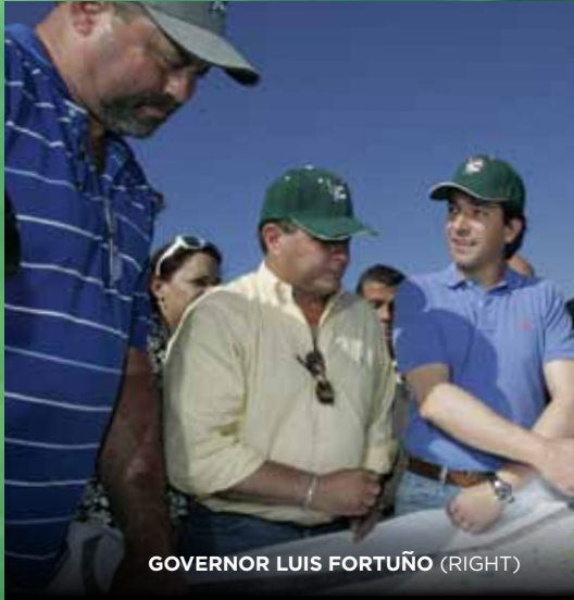
GOVERNOR LUIS FORTUÑO (RIGHT)