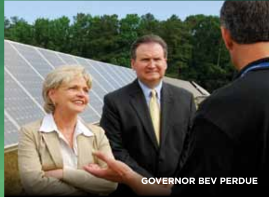
GOVERNOR BEV PERDUE

Puerto Rico Governor Luis Fortuño signed the most advanced public-private partnership legislation in the nation, creating the Public-Private Partnership Authority as the sole government power to authorize and oversee public-private partnerships in Puerto Rico. The law opens up new opportunities for investment in Puerto Rico's infrastructure and will help improve public services. The first 26 projects represent a total potential investment of nearly $7 billion and the creation of more than 130,000 construction jobs.