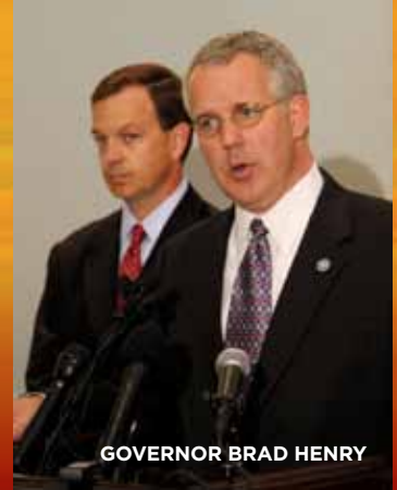
GOVERNOR BRAD HENRY

The legislation maintains that students graduate with 4 years of math and science, expands students' opportunities to take innovative career and technology courses aligned with college-ready standards, and provides parents/teachers with unprecedented access to student achievement data.