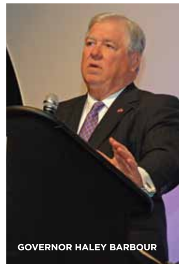
GOVERNOR HALEY BARBOUR

In 2009, Mississippi Governor Haley Barbour announced the creation of the Mississippi Energy Policy Institute, a Momentum Mississippi initiative, to promote policies and a long-term strategy for developing energy resources within the state. Momentum Mississippi will engage a broad-based coalition from different energy sectors to join the Institute, which ultimately will be comprised of industry organizations, companies, colleges and universities focused on fostering Mississippi's potential as a reliable energy producer for America.