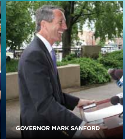
GOVERNOR MARK SANFORD

Under Maryland Governor Martin O'Malley's leadership, the state has become a national model for environmental stewardship and energy conservation. Maryland is at the forefront of Chesapeake and Coastal Bay cleanup efforts through Governor O'Malley's BayStat, GreenPrint and Smart, Green & Growing initiatives. And since taking office, Maryland has significantly increased its renewable energy portfolio standard and set one of the most ambitious greenhouse gas reduction goals in the nation of 25% by 2020.