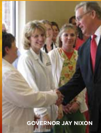
GOVERNOR JAY NIXON