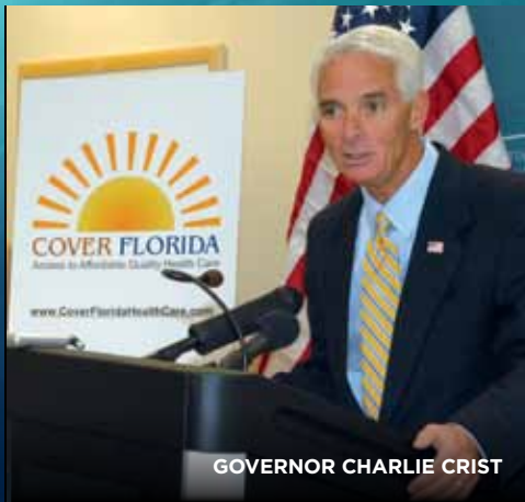
GOVERNOR CHARLIE CRIST