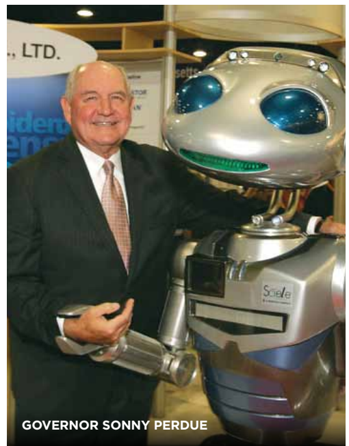
GOVERNOR SONNY PERDUE

This year, Georgia Governor Sonny Perdue welcomed the entire life sciences industry to Atlanta for the 2009 BIO Convention. The 15,000 attendees were able to see, first hand, Georgia’s focus on this sector, including the Georgia Bioscience Seed Fund to advance life sciences in the state — the first-ever seed capital and facilities funds focused specifically on the life sciences industry. The Governor also has placed an emphasis on improving life sciences education and workforce development in the biosciences.