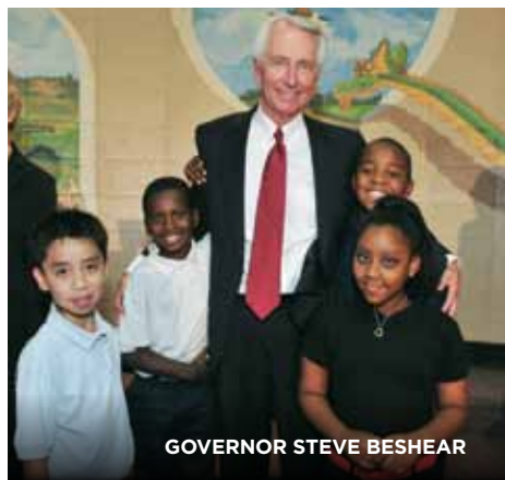
GOVERNOR STEVE BESHEAR

Providing Florida's uninsured with affordable health and dental care has been a top goal of Governor Charlie Crist , who worked hard to implement "The Florida Discount Drug Card," which already has reduced prescription drug costs for seniors and working families. The Governor's "Cover Florida" plan allows the state to negotiate with health insurers to develop affordable health coverage for uninsured Floridians ages 19 to 64, providing affordable options to Florida's 3.8 million uninsured individuals.