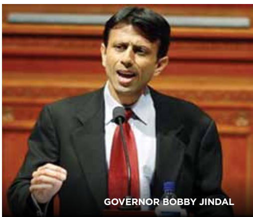
GOVERNOR BOBBY JINDAL

As a result of Louisiana Governor Bobby Jindal's work to reform the state's ethics laws, the Center for Public Integrity (CPI)