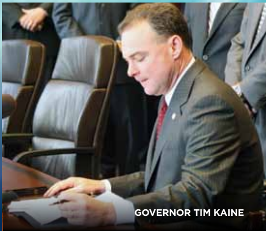
GOVERNOR TIM KAINE