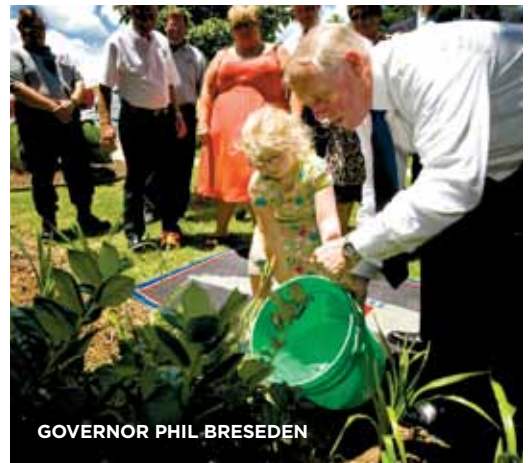
GOVERNOR PHIL BRESEDEN

Tennessee Governor Phil Bredesen proposed the Volunteer State Solar Initiative, a comprehensive solar-energy and economic development program focused on job creation, education, renewable-power production and research, and consisting of two related projects: The Tennessee Solar Institute, which will focus on basic science and industry partnerships; and the West Tennessee Solar Farm, which will serve as a demonstration tool for educational, research and economic-development purposes in partnership with the Tennessee Valley Authority (TVA).