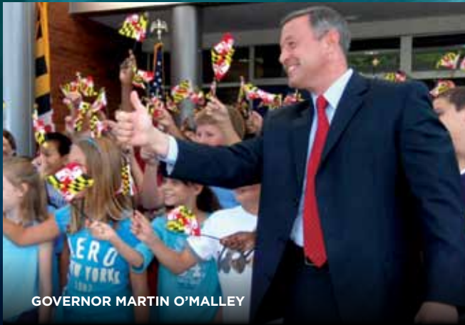
GOVERNOR MARTIN O'MALLEY