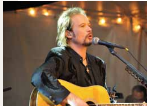
Grammy Award Winner Travis Tritt