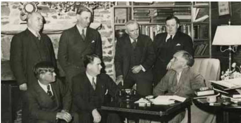
On November 21, 1934, President Franklin D. Roosevelt invited the governors of Alabama, Florida, Georgia, South Carolina and North Carolina to his Little White House in Warm Springs, Georgia, to challenge them to work together for regional improvement. As a result of the meeting, the Southern Governors' Association was born.

Commemorating its legacy of progress, SGA developed a 14-panel poster show that was featured at the Warm Springs event, and was displayed again at the 2010 Annual Meeting in Birmingham. Featuring oversized images and thought-provoking quotes from noted Southerners, the poster show was designed to highlight the region "then and now" in six topical areas — economy, education, civil rights, environment, defense and culture — that showcase the remarkable transformation of the American South from 1934 to the present.