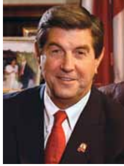
Bob Riley Governor of Alabama 2009-10 SGA Chairman

leaders to pursue greater economic collaboration. Eight of our secretaries of commerce worked together through SGA to present a coordinated face of the American South to Chinese business and political leaders, culminating in a series of June meetings in Beijing. This initial effort was followed by a series of meetings with a delegation of Chinese leaders during SGA's Annual Meeting in Birmingham.