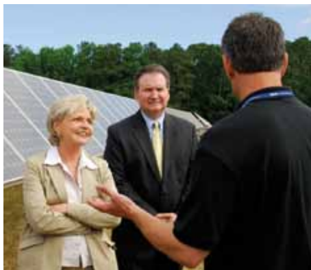
Governor Perdue promotes her state's solar industry.

Governor Perdue knows that in North Carolina green can be gold. Her energy reform package will attract businesses, create jobs and promote a strong and sustainable green economy in North Carolina. The plan reinvigorates the State Energy Office and the Governor's Energy