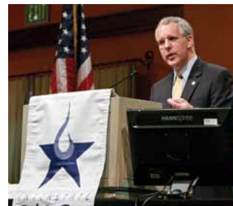
Governor Henry supports a comprehensive energy mix.

Governor Henry signed comprehensive energy legislation that will expand the use of clean energy in Oklahoma, and establishes a goal that 15 percent of the state's electricity be produced from renewable sources by 2015. The bill allows electricity generators to utilize energy efficiency in order to meet that goal. In order to maximize the development of the state's clean burning natural gas, the bill establishes a natural gas energy standard, declaring natural gas to be the preferred fuel for electrical generation.