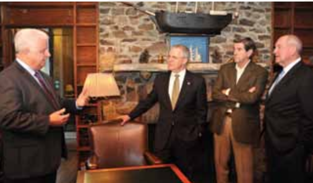
Governors Visit FDR's Little White House