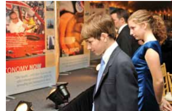
Young Southerners Learn about Their Heritage