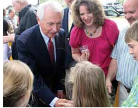
Governor Beshear with Kentucky teachers and students.

During Governor Perdue's terms in office, he has focused on improving education in Georgia. He created the innovative "Graduation Coach" program whereby coaches identify high school students that are at risk of dropping out, and work with them one-on-one to create an individualized graduation plan. The initiative's success led Governor Perdue to extend the program to middle schools. As a result of this initiative, Georgia's graduation rate rose from 63 percent in 2002 to 78 percent in 2009. The state also has seen a 20 percent decrease each year in the number of high school dropouts, equating to 4,500 fewer students ending their educational progress prematurely.