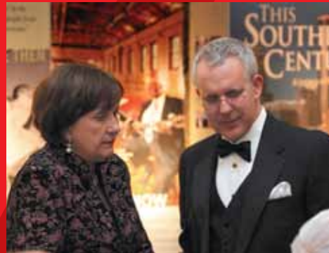
Former Louisiana Governor Kathleen Blanco and Oklahoma Governor Brad Henry