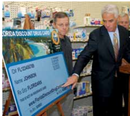
Governor Crist promotes his innovative drug card program.

Early in his term, Governor Perdue created the “Live Healthy Georgia” initiative to raise awareness about chronic disease prevention, and to encourage Georgians to be healthy and active. Over the years, he has continued to promote quality health improvement and has provided a health care grant to seven volunteer clinics to secure access to primary medical and dental care for underinsured and uninsured citizens of Georgia. Last year, he ushered in the first reorganization in more than three decades of the state’s health agencies, combining all state health planning offices into the Depart-