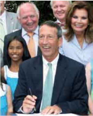
Governor Sanford signs “foster care to adoption” legislation.

Congress and will be implemented in all 50 states. Additionally, South Carolina became the second state in the nation to offer Health Savings Accounts to its employees and retirees, giving consumers more direct control of their health care dollars. The state is working to implement a similar program for Medicaid recipients. Under the program, unspent dollars would roll over to the next year or could even follow a Medicaid patient that leaves the system.