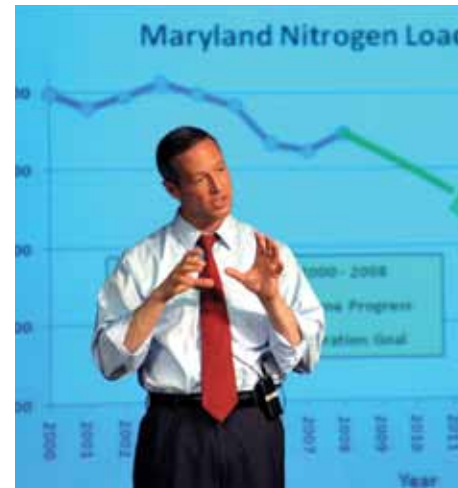
Governor O'Malley discusses his "Baystat" Initiative.

Other innovative programs include the Maryland Sustainable Growth Commission to advise on and promote smart planning and sustainable growth across the state; legislation to strengthen local compre-