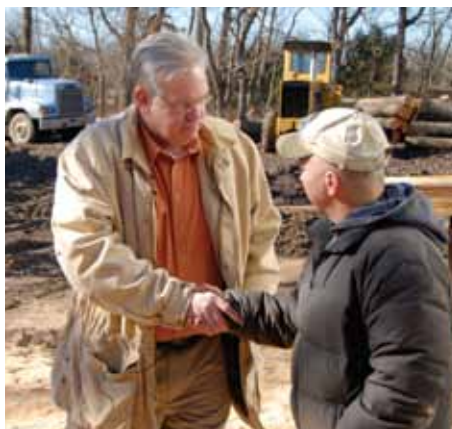
Governor Nixon promotes small business incentives.

Responding to the need of many small businesses that have had difficulty in ac-