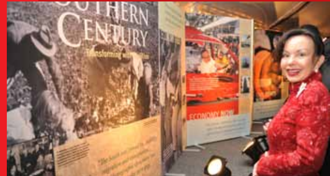
SGA's Commemorative Poster Show Exhibit