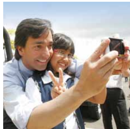
Governor Fortuño takes time with students.

approximately $100 million in new funds for Oklahoma's endowed chairs program. The program matches private donations with state dollars to endow professorships to lure the best and brightest faculty to Oklahoma's colleges and universities.