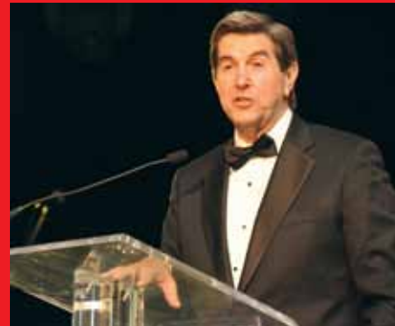
Alabama Governor Bob Riley SGA Chairman