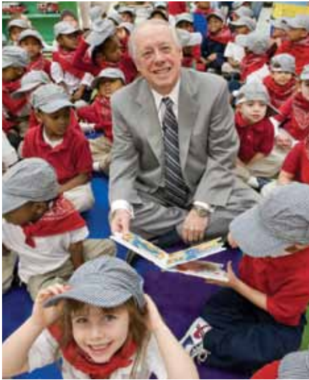
Governor Bredeesen promotes reading.

the Top Act of 2010” and the “Complete College Tennessee Act of 2010.” The new laws are designed to spur improvement in Tennessee’s education pipeline — specifically, improving student performance and graduation rates at both the high school and college levels.