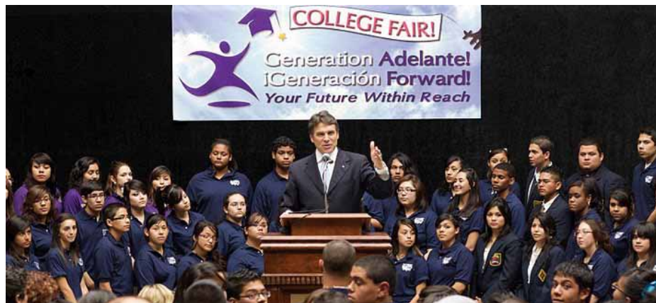
Governor Perry with college bound students.

Governor Manchin has repeatedly shown his commitment to improving education for all West Virginians. During a time where other states have been forced to balance their budgets by cutting education, he has held strong to keep the state’s education budget intact. He has worked to bring community, business, labor, workforce and education leaders together to support education from childhood through lifelong learning, and created the “21st Century Jobs Cabinet of West Virginia.” He has worked closely with the State Board of Education to reform legislation, and he supported efforts to increase high school graduation and early childhood education.