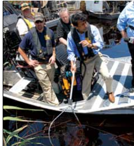
Governor Jindal responds to the Gulf oil spill.

He also believes it is critical to view offshore energy production as one component of a comprehensive energy policy that is consistent with national security, energy security, environmental security