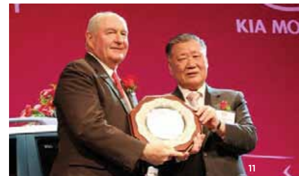
Governor Perdue at Kia Motor's grand opening.