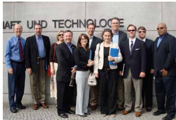
Energy policy representatives from the American South visited Germany to learn how the country has worked to achieve low-carbon growth.

Over the past year, SGA has provided Governors and their staff with weekly updates of climate and energy related activities that have transpired at the federal and international level. These "round-ups" featured reports on the progress of climate change and energy legislative proposals, new environmental regulations that could impact SGA's member states and territories and the evolution of international negotiations on greenhouse gas limits. As the climate and energy debate continues in Washington, SGA staff will remain abreast of these issues and their respective policy decisions in order to keep Governors and their staff informed about implications for their constituents, and the American South as a whole.