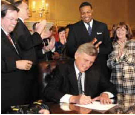
Governor Beebe signs health care reform legislation.

reports. The Arkansas Coalition for Obesity Prevention has secured funding to help five communities establish programs designed to improve the nutrition and physical activity levels of their citizens.