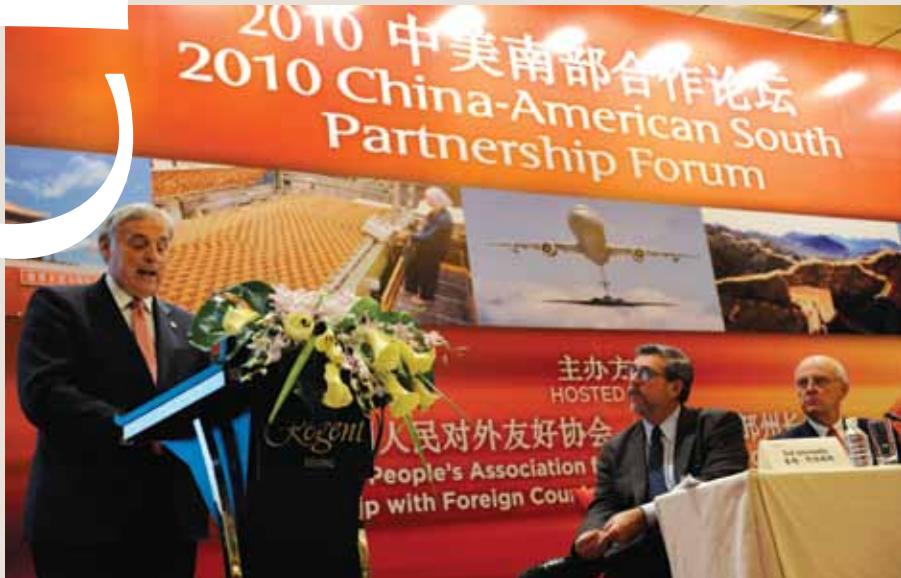
Trade representatives from the American South met with their Chinese counterparts at the first China-American South Partnership Forum in Beijing.

The Partnership Forum allowed Southern secretaries of commerce to hear from Chinese economic development and investment leaders about the unique strengths and interests of different Chinese provinces. Most importantly, they were able to forge new relationships with their Chinese counterparts. These relationships are the building blocks for identifying potential investment opportunities, prospects for new trade relationships and possibilities for collaboration between Southern and Chinese businesses. These relationships are the first step towards creating new jobs in the South. Through the Partnership Forum, Southern states and territories began to build a foundation that will lead to greater economic prosperity for their residents and for the people of China.