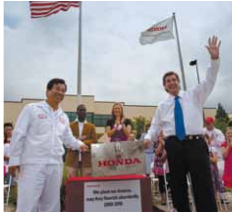
Governor Riley celebrates Honda's 10th anniversary.

Governor Beebe has worked vigorously to recruit new businesses, both from within the United States and abroad.