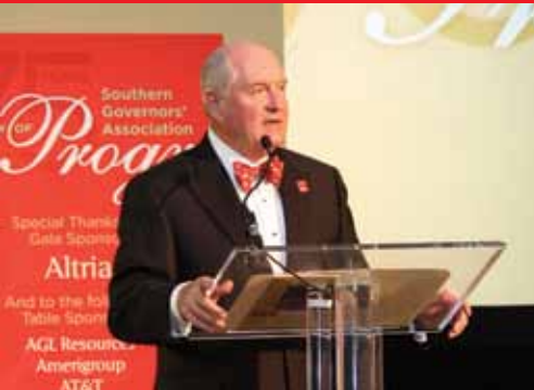
Georgia Governor Sonny Perdue Event Host