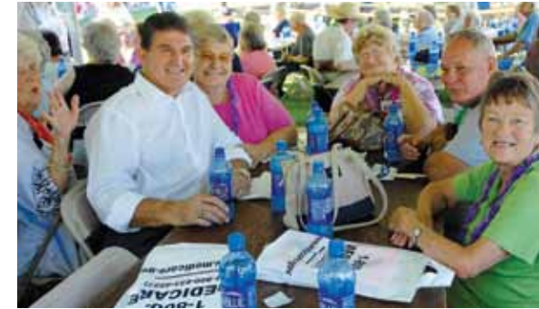
Governor Manchin talks with West Virginia seniors.

With all 50 states preparing for the implementation of federal health care reform, Governor McDonnell announced the creation of the Virginia Health Reform Initiative that will facilitate adaptation of federal health care requirements and prepare for the increase in Virginia’s Medicaid rolls. Governor McDonnell also signed legislation authorizing the development of a Health Care Workforce Development Authority to look at the current landscape of Virginia’s health care workforce, identify issues and best practices and make recommendations to address each area respectively. As an advocate for preventative health efforts, Governor McDonnell convened Virginia’s first statewide Childhood Obesity Conference, the “Weight of the State,” where the most current data and statistics on childhood obesity in the Commonwealth were presented, including school nutrition programs, physical fitness initiatives, pediatric health care approaches and plans to deliver prevention messages to young Virginians via social marketing techniques.