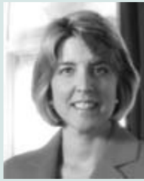
GOVERNOR ROBERT L. EHRLICH, JR. FIRST LADY KENDEL EHRLICH

BIRTHDATE: November 25, 1957 BIRTHPLACE: Arbutus, Maryland EDUCATION: Princeton University BA 1979, Wake Forest School of Law J.D. 1982 PARTY: Republican FAMILY: Two children RELIGION: Methodist ELECTED: November 2002 TERM EXPIRES: January 2007