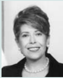
GOVERNOR JEB BUSH FIRST LADY COLUMBA BUSH

BIRTHDATE: February 11, 1953 BIRTHPLACE: Midland, Texas EDUCATION: University of Texas B.A. 1973 PARTY: Republican FAMILY: Three children RELIGION: Catholic ELECTED: November 1998, November 2002 TERM EXPIRES: January 2007