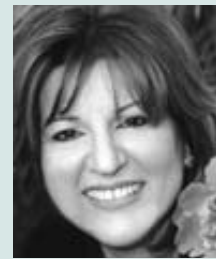
GOVERNOR ANÍBAL ACEVEDO-VILÁ FIRST LADY LUISA GÁNDARA ACEVEDO-VILÁ