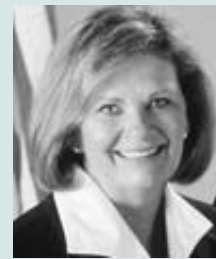
GOVERNOR HALEY BARBOUR FIRST LADY MARSHA BARBOUR