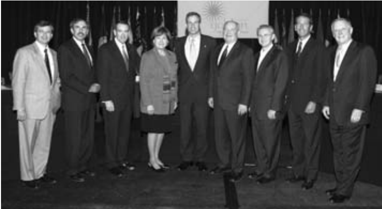
Pictured at SGA's 2004 Annual Meeting, in Richmond, Virginia, are Govs. Ernie Fletcher (Ky.), Bob Wise (W.V.), Mike Huckabee (Ark.), Kathleen Babineaux Blanco (La.), Mark R. Warner (Va.), Sonny Perdue (Ga.), Bob Holden (Mo.), Mark Sanford (S.C.), and Phil Bredesen (Tenn.).

This year has been a time of renewal and collaboration. Through my Chairman's Initiative, SGA spent the last year focusing