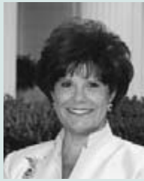
GOVERNOR BOB RILEY FIRST LADY PATSY RILEY

BIRTHDATE: October 3, 1944 BIRTHPLACE: Ashland, Alabama EDUCATION: University of Alabama B.A. 1965 PARTY: Republican FAMILY: Four children, four grandchildren RELIGION: Baptist Elected: November 2002 TERM EXPIRES: January 2007