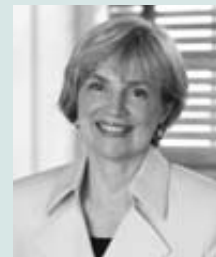
GOVERNOR PHIL BREDESON FIRST LADY ANDREA CONTE

BIRTHDATE: November 21, 1943 BIRTHPLACE: Oceanport, New Jersey EDUCATION: Harvard University B.S. 1967 PARTY: Democrat FAMILY: One child RELIGION: Presbyterian ELECTED: November 2002 TERM EXPIRES: January 2007