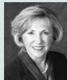
GOVERNOR JOE MANCHIN III FIRST LADY GAYLE CONELLY MANCHIN

BIRTHDATE: August 24, 1947 BIRTHPLACE: Farmington, West Virginia EDUCATION: West Virginia University B.A. 1970 PARTY: Democrat FAMILY: Three children, six grandchildren ELECTED: November 2004 TERM EXPIRES: January 2009