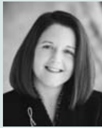
GOVERNOR MATT BLUNT FIRST LADY MELANIE ANDERSON BLUNT

BIRTHDATE: November 20, 1970 BIRTHPLACE: Springfield, Missouri EDUCATION: United States Naval Academy B.S. 1993 PARTY: Republican FAMILY: One child RELIGION: Baptist ELECTED: November 2004 TERM EXPIRES: January 2009