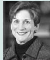
GOVERNOR SONNY PERDUE FIRST LADY MARY PERDUE

BIRTHDATE: December 20, 1946 BIRTHPLACE: Perry, Georgia EDUCATION: University of Georgia D.V.M. 1971 PARTY: Republican FAMILY: Four children, three grandchildren RELIGION: Baptist ELECTED: November 2002 TERM EXPIRES: January 2007