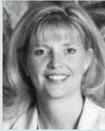
GOVERNOR BRAD HENRY FIRST LADY KIMBERLY HENRY

BIRTHDATE: June 10, 1963 BIRTHPLACE: Shawnee, Oklahoma EDUCATION: University of Oklahoma B.A. 1985, University of Oklahoma College of Law J.D. 1988 PARTY: Democrat FAMILY: Three children RELIGION: Baptist ELECTED: November 2002 TERM EXPIRES: January 2007