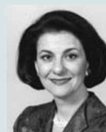
GOVERNOR MICHAEL F. EASLEY FIRST LADY MARY EASLEY