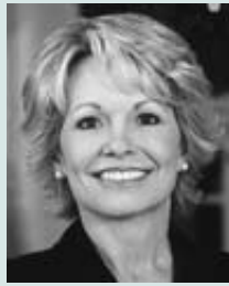
GOVERNOR ERNIE FLETCHER FIRST LADY GLENNA FLETCHER

BIRTHDATE: November 12, 1952 BIRTHPLACE: Mt. Sterling, Kentucky EDUCATION: University of Kentucky College of Engineering B.S. 1974; University of Kentucky College of Medicine M.D. 1984 PARTY: Republican FAMILY: Two children, four grandchildren RELIGION: Baptist ELECTED: November 2003 TERM EXPIRES: December 2007